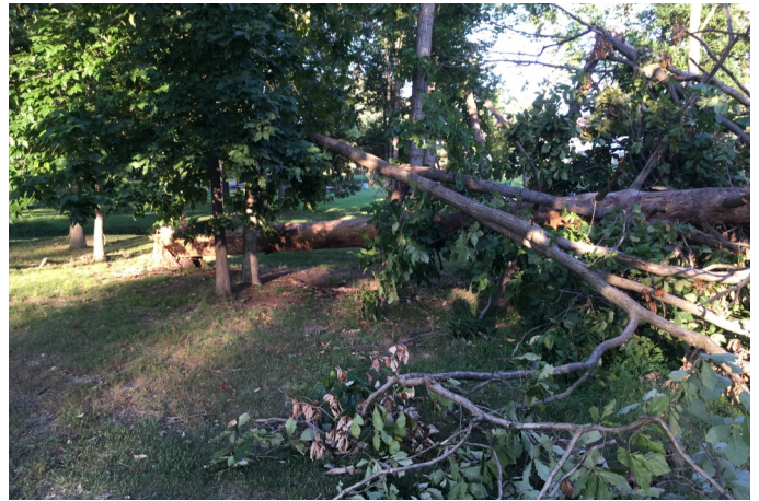
Storm damage in the park

Candidate nominations for the annual Good Neighbor of the Year Award are requested by October 27. The person (or persons) selected will be presented with a plaque at the annual meeting on November 14. Send nominations to: board@rha-homes.org