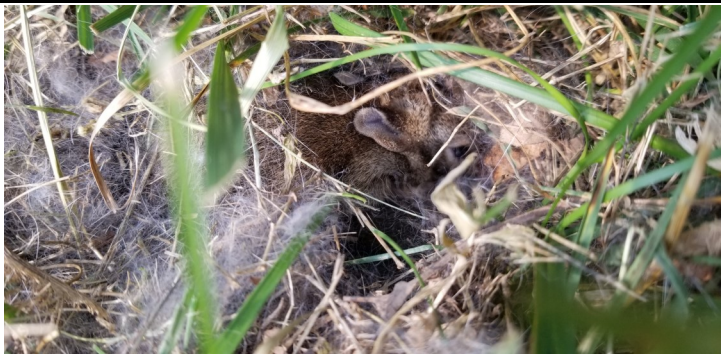
At least three baby bunnies called this "Home": 6 inch diameter, 4 inch deep camouflaged nest buried beneath the yard's surface.

All kinds of four-legged creatures carve out homesteads throughout RHA – some indoors, some outdoors. Besides dogs and cats, rarely does a day go by without sightings of squirrels, mice, rats, ground hogs, opossums, skunks, foxes and rabbits.