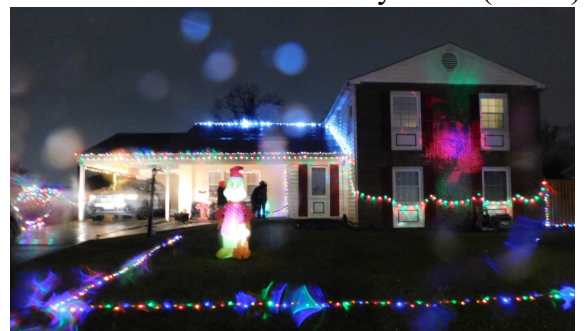
Maleady Drive (below)