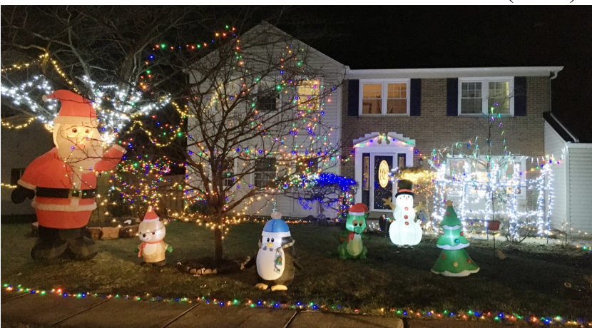
Keisler Court (below)