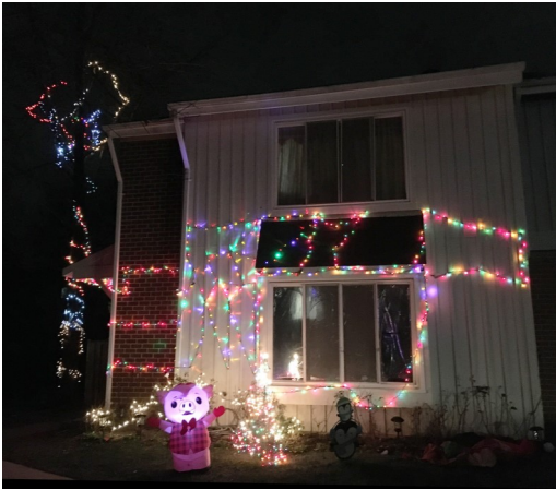
Oram Place (above)

Finally, we came up with SIX winners to split the pot! Congratulations to the homes on: Oram, Fones, Schwenger, Keisler and two homes on Maleady. WELL DONE!