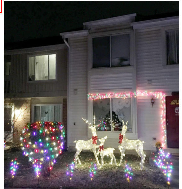
Fones Place (above)