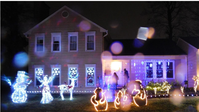
Maleady Drive (above)

Small photos just don't do justice to these displays -- please drive/walk around & enjoy them in person!